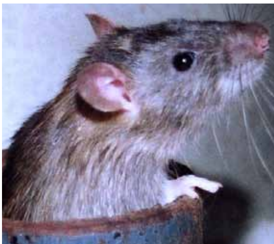
Rats carry many disease-causing pathogens as well as being responsible for fires and floods in buildings. Their presence is often a sign of a degraded area.

Tamper-resistant containers baited with immovable block baits are appropriate if baits are inspected infrequently, but the evidence presented in this review suggests that relatively little rodent control will be achieved.