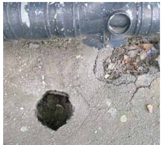
A rat burrow in a housing estate in London. Placing bait directly into burrows where rats live and eat results in quicker control and minimises the risk of secondary poisoning to non-target species.

Bait transfer becomes less likely if rats can feed in groups; biologically, group-feeding presumably offers some protection from a predator attack.