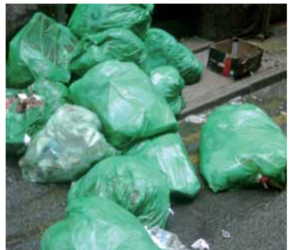
Rubbish is often left out in streets overnight or dumped in alleys, presenting a challenge to pest control services.