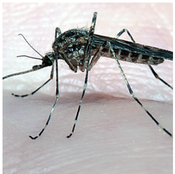
Culiseta annulata 13 -15mm wingspan