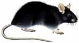
Black rat, ship rat ( Rattus rattus )