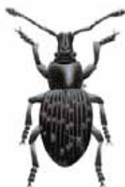
Garden weevils, Clover weevils (Family Curculionidae)