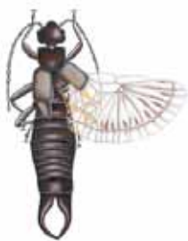
Earwigs (Order Dermaptera)

Colour: black with patches of minute, yellow scales ( O. sulcatus ), or dark reddish-brown without scales ( O. rugostriatus ). Sitona are variously coloured and 5mm in length.