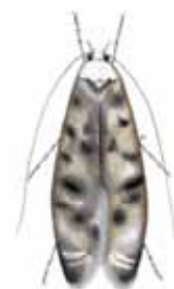
White shouldered house moth ( Endrosis sarcitrella )

Open wingspan 10–23mm. readily distinguished from other stored product moths by the covering of white scales on the head and thorax. The shining buff upper side of the forewing is speckled with dark brown.