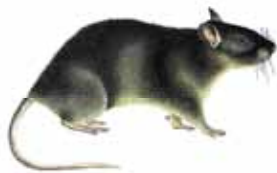
Brown rat, common rat, Norway rat, sewer rat ( Rattus norvegicus )