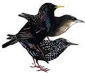
Starling Sturnus vulgaris