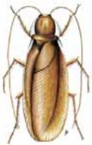
Brown-banded cockroach ( Supella longipalpa )