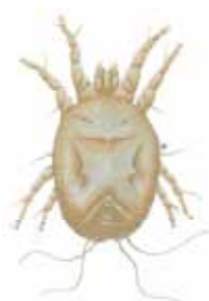
House dust mite ( Dermatophagoides pteronyssinus )

Size: 8mm long, recognised by short, thick snout (rostrum) in front of the eyes and elbowed antennae.