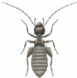
Booklice or Psocids (Order Psocoptera)