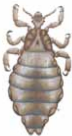
Head louse ( Pediculus humanus capitis )