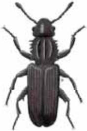
Merchant grain beetle ( Oryzaephilus mercator )