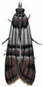
Indian meal moth ( Plodia interpunctella )