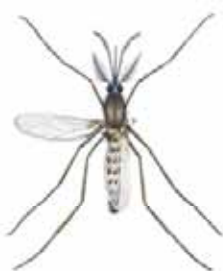
Mosquitoes (family Culicidae)