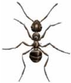
Black garden ant ( Lasius niger )

Ghost ants are approximately 1.5mm in size and have almost transparent legs and abdomen with a dark brown head and thorax. Smaller and faster than Pharaoh's ants they also have many queens in the nest and follow trails to and from the food source.