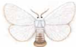
Brown-tail moth (Family Lymantriidae )