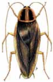
German cockroach ( Blattella germanica )