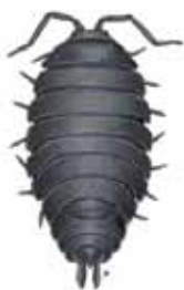
Woodlice (Class Crustacea; Order Isopoda)

For woodlice breeding indoors, e.g. under baths and in cellars, remove decaying timbers or organic matter and dry out area. Remove vegetation and debris from around house walls.