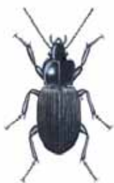
Ground beetles (Family Carabidae)