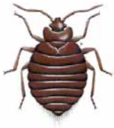
Bedbug ( Cimex lectularius )