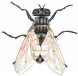
Common housefly ( Musca domestica )