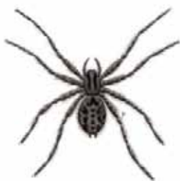
Spiders (Class Arachnida )

The slimy trails and faecal pellets can deface furnishings and the rasping tongue will remove paper labels from tins and damage packaging. As slugs and snails rarely exist away from damp locations efforts should be made to dry out areas below sink units, fitted cupboards and baths. Vegetation should be cleared from around entry points where possible, although both slugs and snails are capable of crossing cleared areas when active during the hours of darkness.