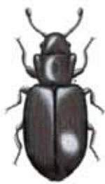
Plaster beetles (Family Lathridiidae )