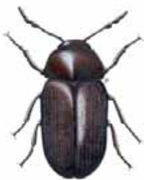
Biscuit beetle ( Stegobium paniceum )