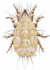
Flour mite ( Acarus siro )

Stored product insects (SPI) are significant pests as they spend the majority of their time, including breeding, hidden in their chosen food type. Inspection and early detection can therefore prove difficult. The group known as SPI in this context includes mites. Commodities attacked include cereals, nuts, dried fruit and pulses.