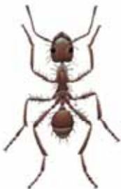
Red ant ( Myrmica rubra )