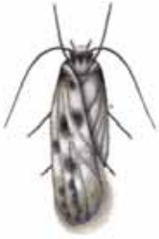
Brown house moth ( Hofmannophila pseudospretella )