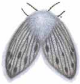
Moth flies (Psychodid flies, family Psychodidae)