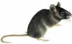
House mouse ( Mus domesticus )