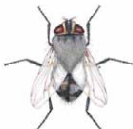
Cluster fly ( Pollenia rudis )