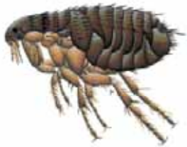
Cat flea ( Ctenocephalides felis )

Where infestations are heavy, the lice may fall off and can then be found in toilets and bedrooms. Head lice are short-lived, and most which fall off are injured or dying.