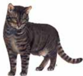
Feral cats Family Felidae

where there are also tame cats nearby and the two groups live side-by-side amicably with an occasional tame animal transferring to the feral group. The activity periods of the cats are largely governed by the activities on the site where they are living. Cats will be active during daylight hours if that is when they are fed.