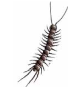
Centipedes (Class Chilopoda)