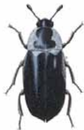
Leather beetle ( Dermestes maculatus )

Particular species of SPI normally, but not always, infest each type of product. Please see Figure 1 below: