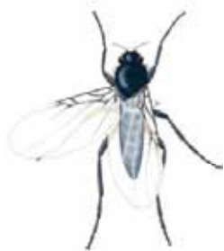
Phorid or drain flies (Scuttle flies, family Phoridae)