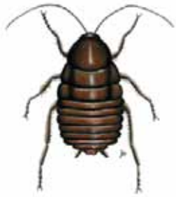
Oriental cockroach ( Blatta orientalis )