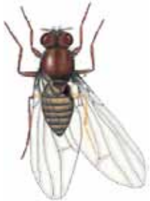
Fruit flies ( Drosophila spp)