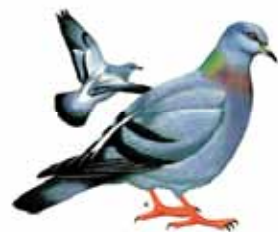
Feral pigeon Columba livia var