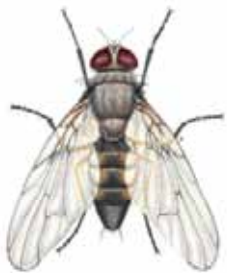
Lesser housefly ( Fannia canicularis )