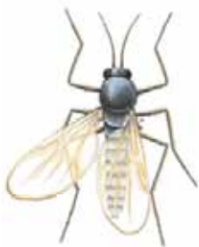
Biting midges ( Culicoides spp)