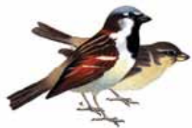
House sparrow Passer domesticus