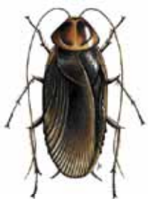
American cockroach ( Periplaneta americana )

Based on fossil records, cockroaches have remained little changed for 200 million years.