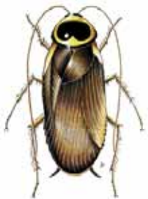
Australian cockroach ( Periplaneta australasiae )