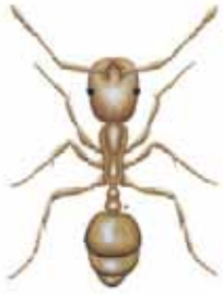
Pharaoh's ant ( Monomorium pharaonis )