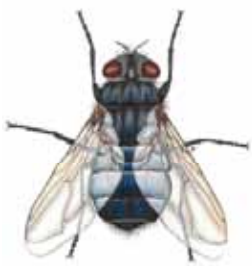
Blowflies ( Calliphora spp)