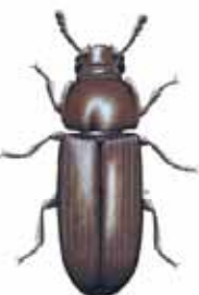
Confused flour beetle ( Tribolium confusum )